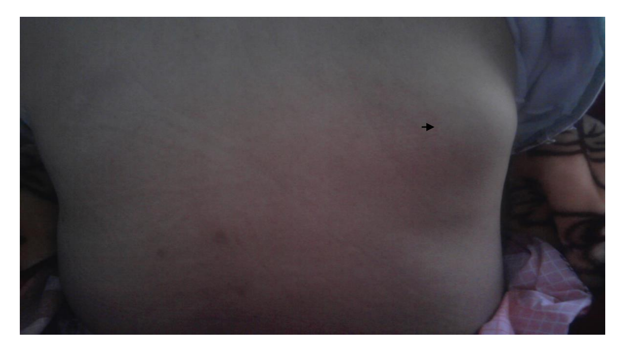
Fig 1. Secondary on the back of right chest